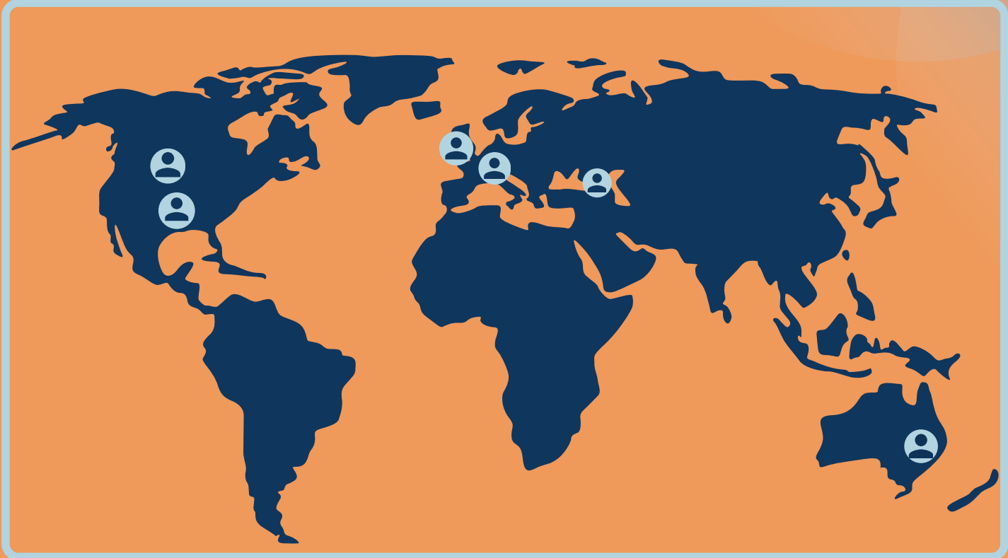
Unique visits to our website in 2023 by location compared to 2022 :