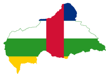
Central Africa Republic